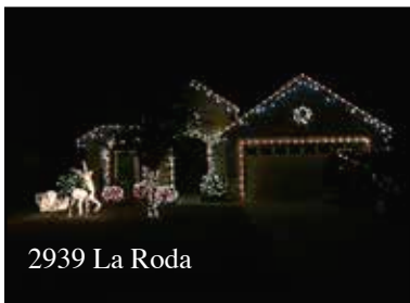
2939 La Roda