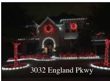
3032 England Pkwy