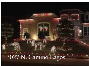
3027 N. Camino Lagos