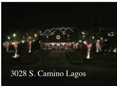
3028 S. Camino Lagos