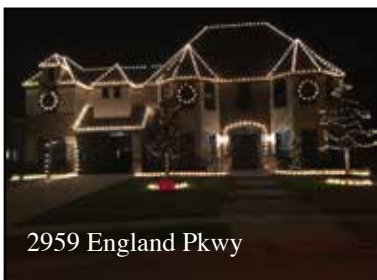
2959 England Pkwy