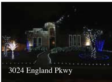
3024 England Pkwy