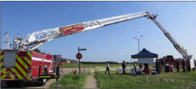
By Rebecca Newton

Construction is underway for a new Fire Station in Mira Lagos. Grand Prairie Fire Station No. 10, will sit at the intersection of South Grand Peninsula and Balboa, adjacent to the new Enclave at Mira Lagos apartments. The brick structure will be a four-bay station, similar in layout to Fire Station #1, at 510 W. Main Street. Our new Fire Station will feature a tower, with a light-house and nautical theme that greatly compliments our community. Expected completion is May, 2016.