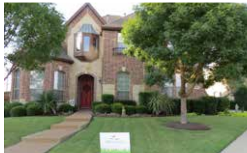
Bella Vista - 2908 England Pkwy