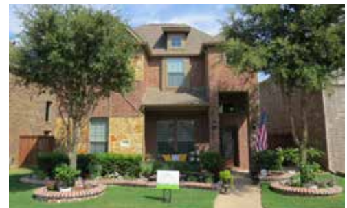
Sonora - 6928 Sarria