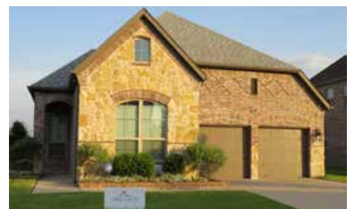
El Mirador - 2803 Mastil