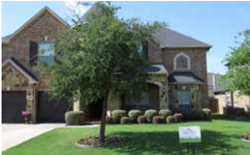
El Llano - 2948 Montalbo

Here are the 15 Winners of the August 2019 Yard of the Month Contest: