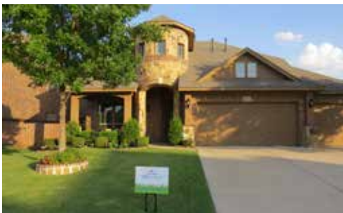
Escondido - 2955 Lavanda