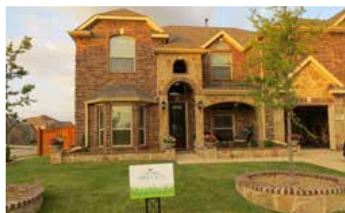
La Jolla - 7112 Playa Paraiso