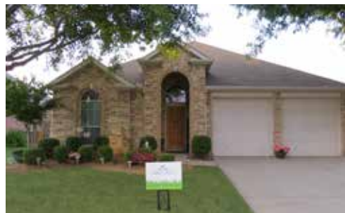
El Sendero - 2856 Prado