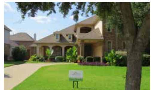
La Ensenada - 2936 N Camino Lagos