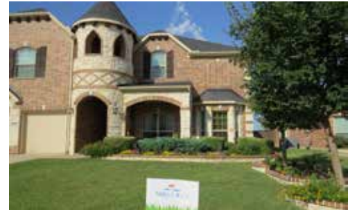
La Tierra - 7236 Roble