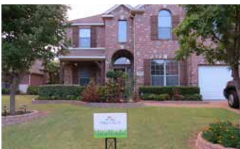
Cordova - 3028 Rosina