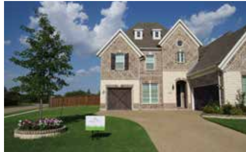
Las Brisas - 7324 Vienta Pt