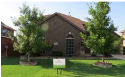
Valencia - 2720 Ponce de Leon