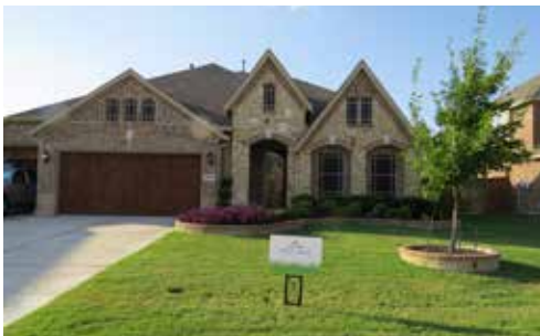
La Pradera - 3204 Meseta