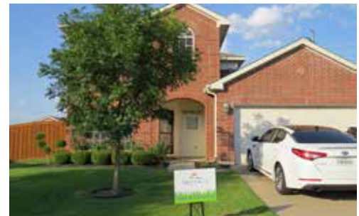
El Arroyo - 7404 Tormes