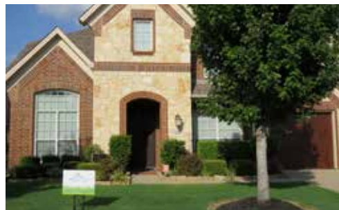
Marbella - 7220 Rueda