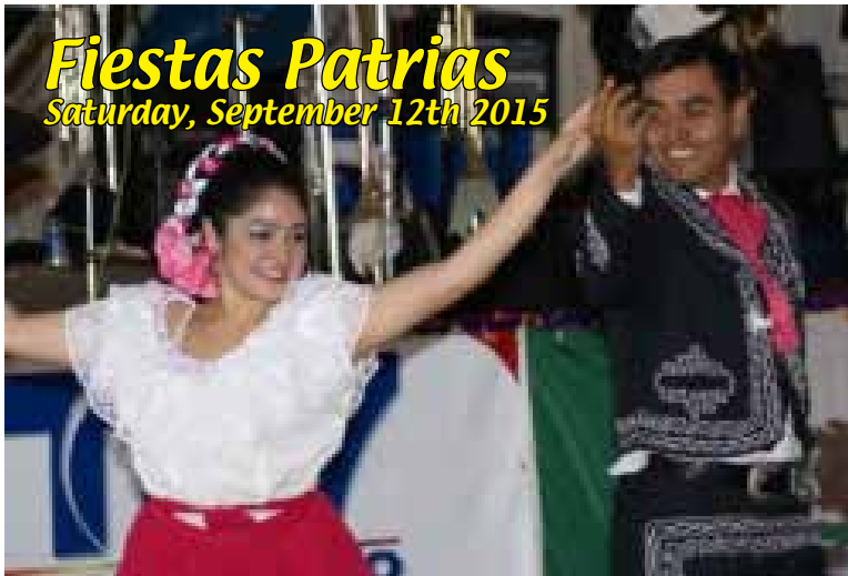
Fiestas Patrias Saturday, September 12th 2015

For more information call 972-237-8151 or email pmarcum@gptx.org .