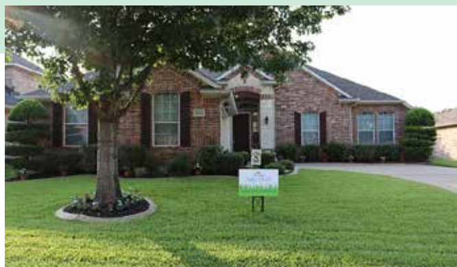
La Enseada ~ 2928 Nadar