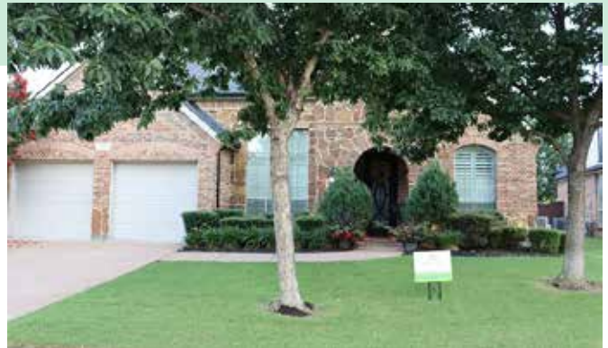
Cordova ~ 3043 Nadar