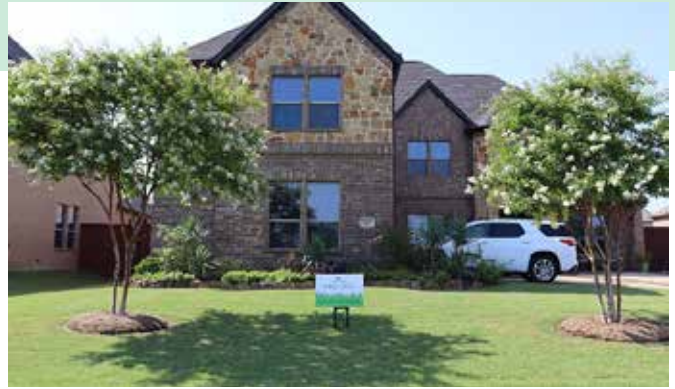
Bella Vista ~ 2819 England Pkwy