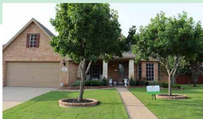
Marbella ~ 2664 Fuente