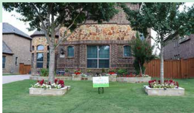
Escondido ~ 2951 Lavanda