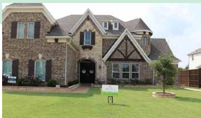
Las Brisas - Gated ~ 2716 Neblina Ct