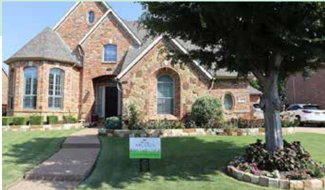
Bella Vista ~ 2948 England Pkwy