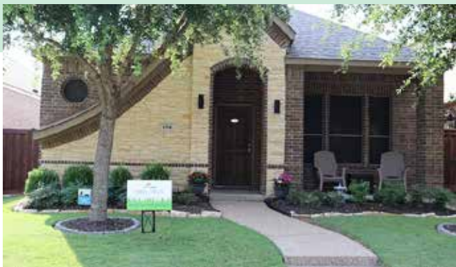
Sonora ~ 6941 Sarria