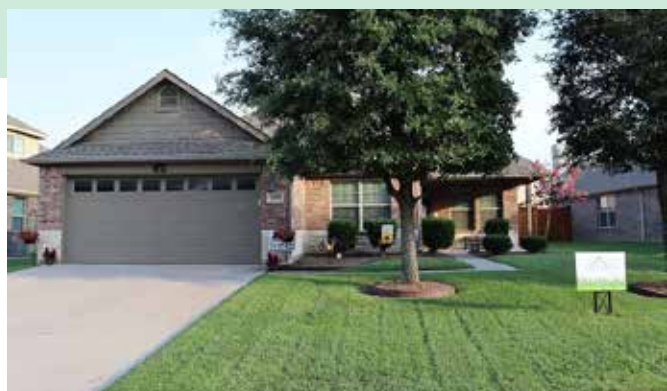
El Llano ~ 2919 La Roda