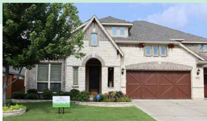
Las Brisas ~ 7332 Vienta Pt.