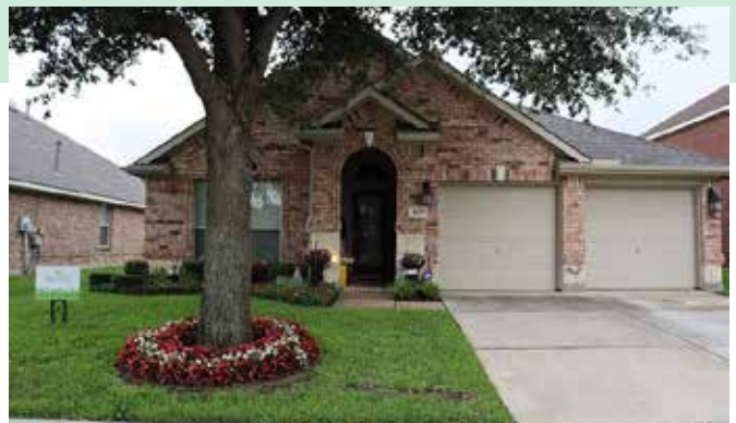
El Sendero ~ 2835 Tranquilo

The Landscape Committee will choose monthly winners through August. If you would like your lot to be considered, make sure your property is mowed, edged, and weed free ( including your flower beds ) and that your homeowner account is free of violations.