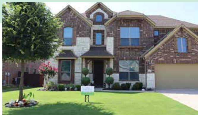
La Pradera ~ 3115 Paseo