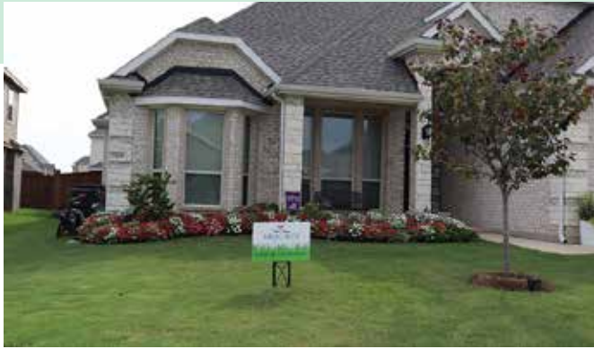
La Jolla ~ 7119 Playa Paraiso Dr.

Congratulations to our neighbors at the following addresses for winning Yard of the Month for July! Each winning homeowner has been recognized with a Yard of The Month sign in their yard. Winners will also receive a gift card.