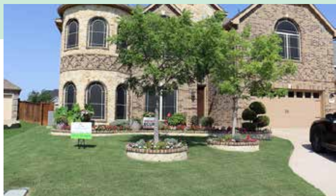
La Tierra ~ 7223 Laguna