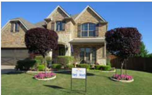
La Ensenada - 2955 Bahia