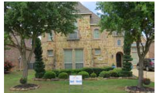
Cordova - 3040 N Camino Lagos