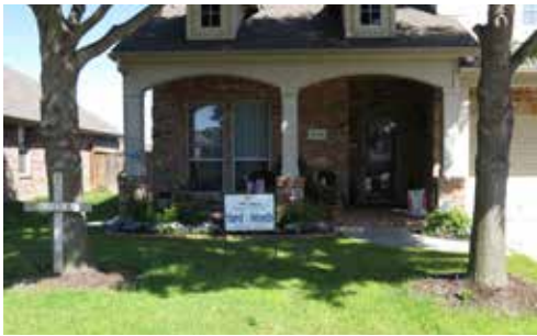
El Arroyo - 3123 Guadalupe