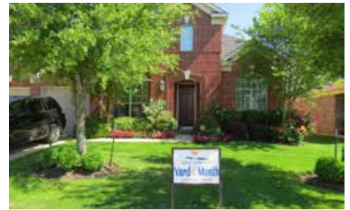
Marbella - 2779 Explorador