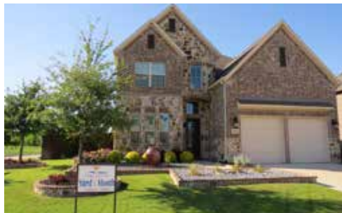
El Mirador - 2803 Mastil