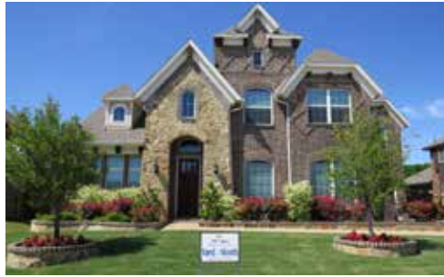
Las Brisas - 7375 Vienta Point