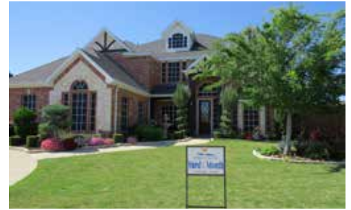
La Tierra - 2804 Pino