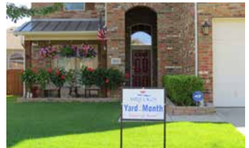
El Sendero - 2839 Barco