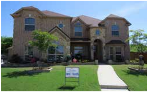
El Llano - 7347 Darsena

Thank you for those that got their yards in shape already this year! It was a challenge I'm sure with all the rain we have had, yet you still accomplished it! Here are the 15 Winners of the May 2019 Yard of the Month Contest: