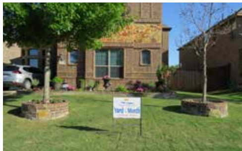
Escondido - 2951 Lavanda