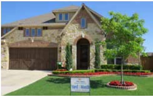
La Pradera - 3127 Pampa