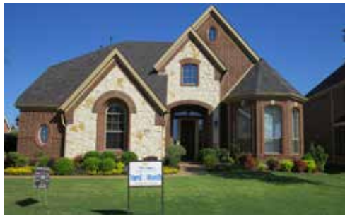
Bella Vista - 3035 England Pkwy