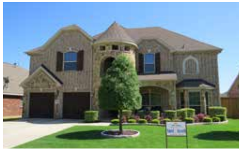
Valencia - 2711 Columbus