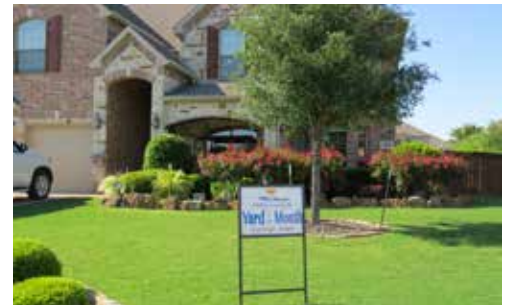
Bella Vista - 2820 England Pkwy