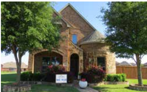
Sonora - 6918 Sarria