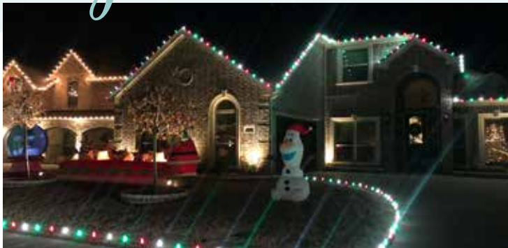
2651 CORONA DR