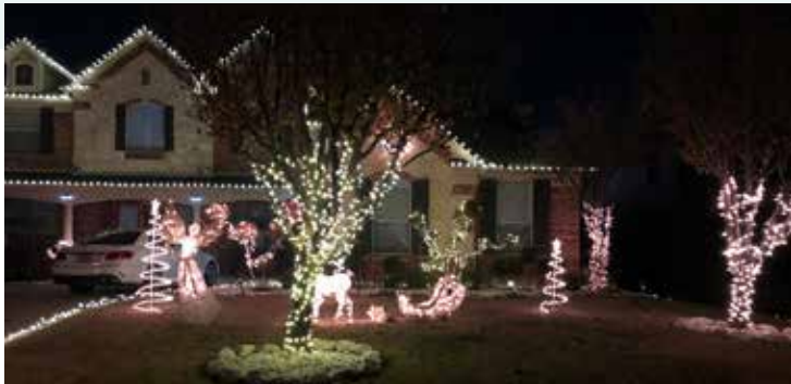
2936 ENGLAND PKWY