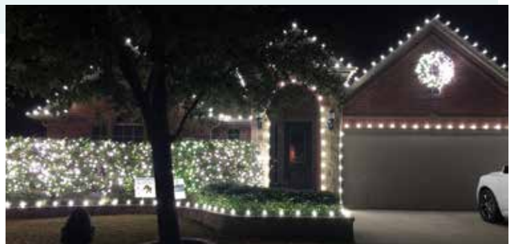
2707 PONCE DE LEON