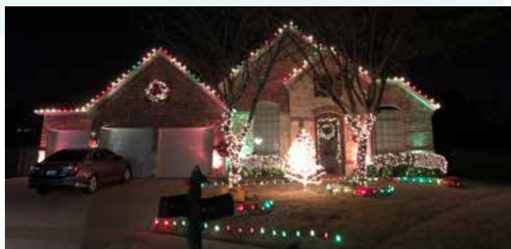
3160 N CAMINO LAGOS