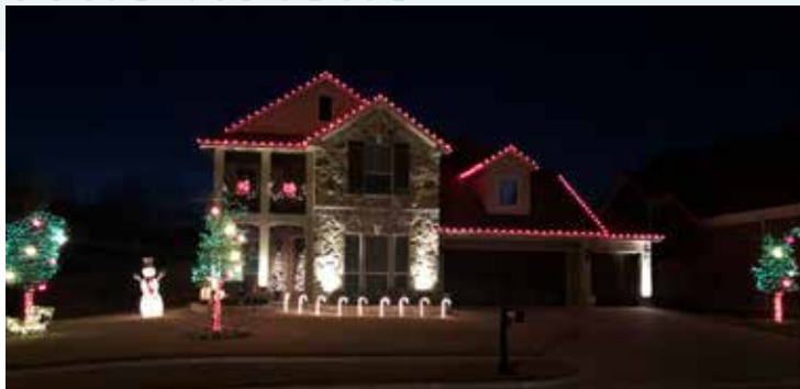
7419 ONDA CT