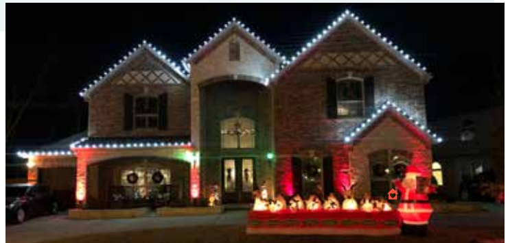
7159 PLAYA IMPERIAL DR