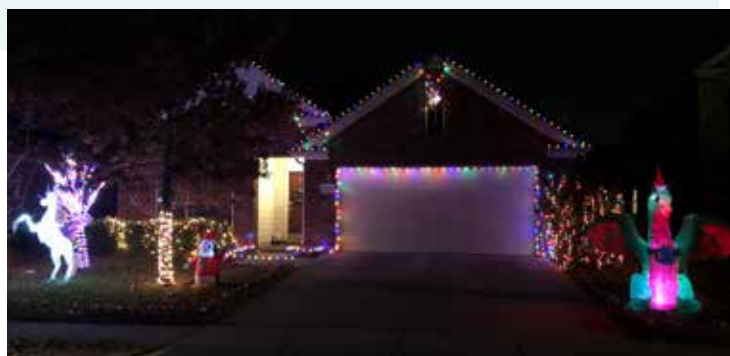
2843 S SERRANO