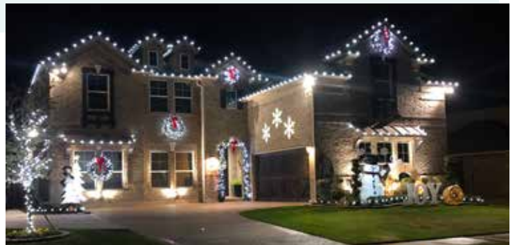
7319 NEBLINA DR