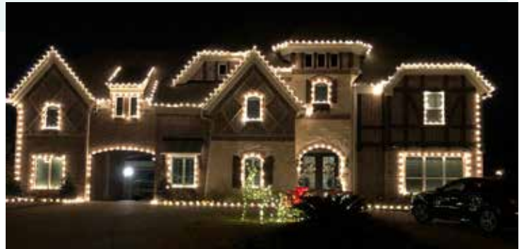
3007 ENGLAND PKWY