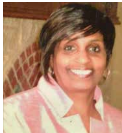
promoting unification and sustaining its vitality.

This outstanding leader believes the Social Committee is the heartbeat of the community,